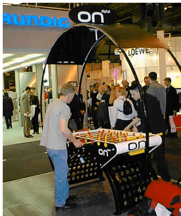
A quiet moment during the 'Beat the Expert' challenge at the On Digital stand at the Birmingham NEC