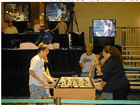
Rookie Mixed final