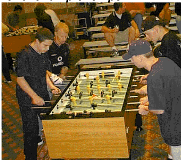
Rookie Doubles Final